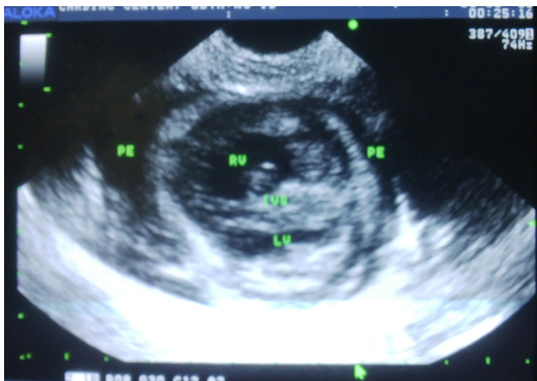
Figure I. Short axis parasternal view of a 10 year old boy showing pericardial effusion around the right ventricle. Indicated as PE on the image

combined was 5(21.7%), MS only was 4(17.4%), MR and aortic regurgitation (AR) combined was 4(17.4) while MR, MS and AR combined in 2 (8.7%). The mitral valve was thus the most frequently involved valve in all the 23(100.0%) cases. The mean age of the children with RHD was 10.7 \pm 3.0 (range; 5 – 15) years.