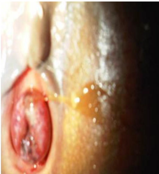
Figure 1. Circular, oedematous interlabial mass.

Histopathological examination of the specimen showed an almost round, firm, greyish tissue measuring 1.1 x 0.9cm and weighing 0.3g. There was a lumen in the central area of the tissue measuring 0.5cm in its widest diameter. Microscopy showed seemingly polypoid tissue covered in parts by transitional to non-keratinised stratified squamous epithelium. The stroma was loose, oedematous and contained many thin walled vessels of varying sizes. Some vessels were tortuous, few were close to the overlying epithelium with accompanying superficial ulceration and there was haemorrhage and thrombosis of the superficial vessels. The stroma was infiltrated by lymphocytes, plasma cells and eosinophils. Some peri urethral glands were noted. A pathological diagnosis of capillary hemangioma compatible with prolapse of the urethra was made.