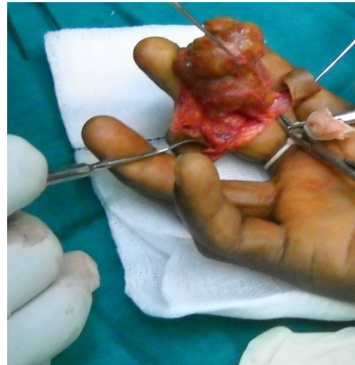
Figure 2. Intraoperative view of a yellowish lobulated lesion.