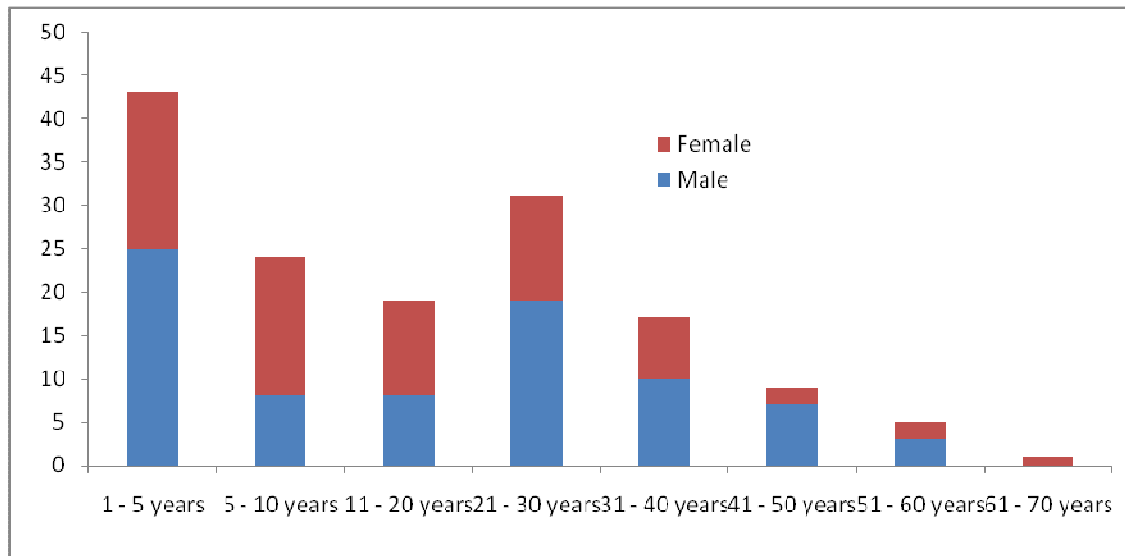
Figure 1. Age and Sex Distributions of the Patients with Ear Injuries.

Most of the foreign bodies (FBs) (58.2%) and trauma from syringing 9/15 (60%) occurred in children (1-10years) while preponderance of RTA 18/23 (78.3%) occurred in age group 21 – 40 years.