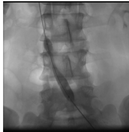
Figure 2. Balloon dilatation of the left common iliac vein occlusion. The point of occlusion forms a waist around the balloon .This was successfully dilated using 10mm and 14 mm diameter balloons