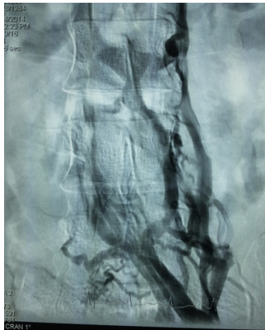
Figure 1. Conventional DSA angiogram through the left femoral vein shows total occlusion of the proximal left common iliac vein at L5 level. Multiple pelvic venous collaterals are seen arising from the point of occlusion.

confirming the diagnosis of MTS (Figure1).The patient subsequently underwent endovascular stenting of the left common iliac vein with two overlapping self expandable stents. The vein was initially dilated with 10 by 80mm balloon (cordis, Europe) via a left common femoral vein puncture (Figure 2). This was followed by 12 by 60 mm one, and finally a 14 by 40 mm balloon. Venogram done immediately after balloon angioplasty showed good blood flow through the occluded segment .To maintain patency a 14mm by 80mm self expanding bare stent [smart stent, cordis Europe] was deployed across the original occluded segment with proximal tip at the IVC-left common iliac vein junction.