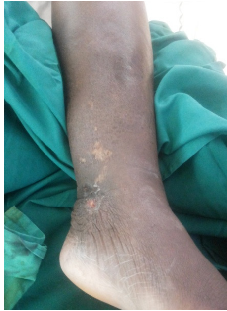
Figure 5. Photograph of the medial aspect of distal left leg shows the ulcer associated with proximal left common iliac vein occlusion. The ulcer had started drying up 24 hours after the stenting

To maintain radial strength against the pulsation of the overlying right common iliac artery, a second similar self expandable stent was deployment about 2 cm below the tip of the first stent (Figure 3). A final DSA venogram (Figure 4) showed good venous inflow into the IVC with non visualization of most of the pelvic venous collaterals. A Doppler ultra sonography done 24 hours after the procedure showed a patent left common iliac vein with a normal biphasic flow pattern. The wet venous ulcer had started drying up. A subsequent follow up CT venogram at 3, 6 and 12 months showed patent left common iliac vein .The left lower limb swelling had gradually resolved and venous ulcer in the distal medial leg completely healed. There were no pain symptoms and patient had returned to normal walking and use of the left lower limb.