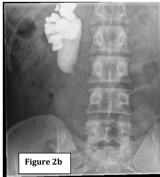
Figure 2a & 2b.. Retrograde pyelography.