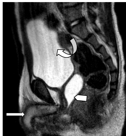
Figure 1. Sagittal T2W MRI showing phallic structure (arrow) which was enlarged clitoris, fluid filled distended uterus (arrow head) and fluid filled urinary bladder (curved arrow).

We present a case of 3-year-old child referred to MNH, a tertiary referral hospital facility with a history of ambiguous genitalia since birth. The child presented with history of absence of testicles and urinary opening was seen on the inferior aspect of the phallus. No other abnormality was reported. Maternal drug history was unremarkable during this child's pregnancy. There was negative history of ambiguous genitalia in the family. Male sex was assigned at birth.