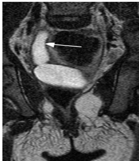
Figure 2. Coronal T2W MRI showing right unicornuate fluid filled uterus (hydrometra)