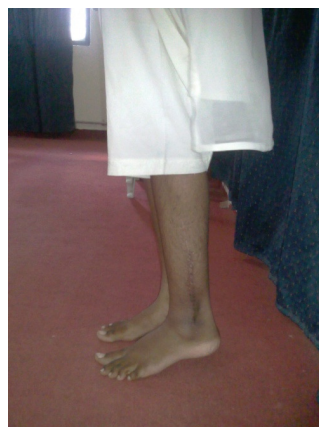
Figure 5. Clinical Picture of Ankle, patient walking full weight bearing