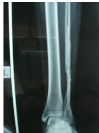
Figure 4. X – ray after implant removal