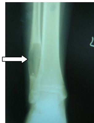
Figure 1. Anteroposterior Radiograph of Ankle suggestive of Osteolytic Lesion in Distal one third of Fibula

A 15 yrs old female came with complaint of pain in left lower leg for 3 months, which was moderate to, severe in nature. Clinical examination revealed swelling and tenderness on the anterolateral aspect of left lower leg. A diffuse non-tender oval swelling of 6 x 4 cms was present over the left lower leg, lateral aspect, the overlying skin was normal and there was no rise local in temperature. Swelling was fixed to the underlying bone smooth surface, hard and bony in consistency. There were no palpable or audible bruits distal pulsations were palpable.