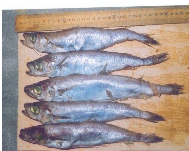
Figure 3: Frozen Hake as displayed in the Market