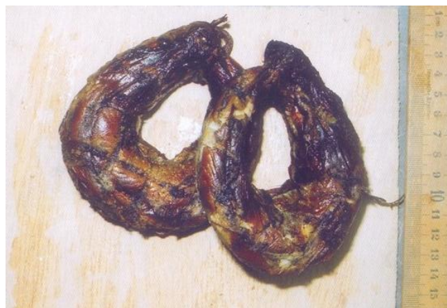
Figure 4: Smoked Hake as displayed in the Market