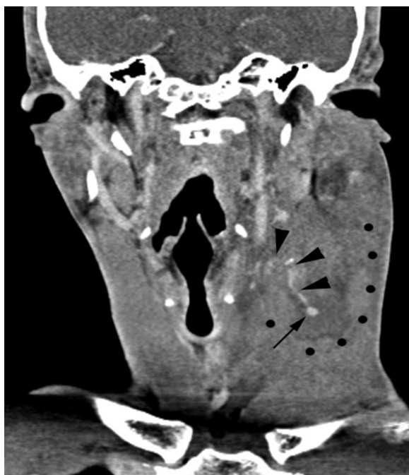
Figure 1: Coronal reformatted contrasted computed tomography of the neck showing an opacified artery (arrowheads) demonstrating a hairpin turn that leads to a focal ovoid region of active contrast extravasation (arrow) within the neck haematoma (its inferolateral margin is marked by dotted lines).

The patient underwent the procedures 5 hours post-trauma without any deterioration of the airway. Post-embolisation, he was observed for 2 days, during which the neck swelling decreased in size by more than 50%. He did not experience ipsilateral tongue numbness or sustain any neurological deficits as a complication of the procedure. At 6 months post-trauma, his neck was healed with total resolution of swelling and normal mobility.