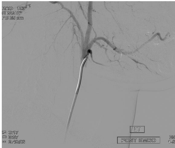
Figure 3: Post-embolisation, digitally subtracted, selective angiography of the lingual artery shows non-opacification of the embolised artery.