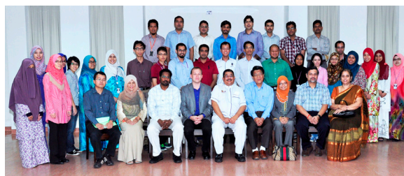
Figure 3: Group photo of the first neuroinformatics meeting in Center for Neuroscience Services and Research, Universiti Sains Malaysia 27th October 2013 with the presence of Prof Sean Hill.