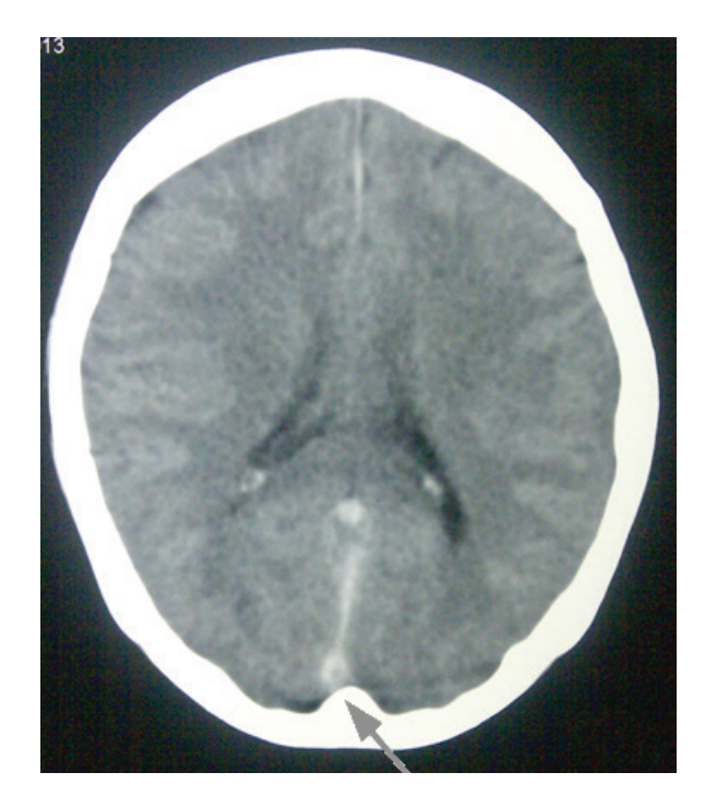
Figure 1: CT imaging of the brain showed a low-density filling defect in the posterior part of the sagittal sinus which signified an empty delta sign (arrows)

She progressed well in the ward with a full neurological recovery within 48 hours of admission. She was ambulating in the ward by day three and had no further behavioural issues, seizures or headaches. She was referred to the gynaecological team and her oral contraceptive was stopped in favour of barrier contraception.