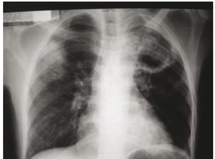
Figure 2a: Chest Xray 2006

The chest radiograph showed consolidation peripherally in the right upper and mid zones. A large, thick walled cavity containing 2 densities were seen in the left apex and, more faintly, a thin walled cavity in the left mid zone (figures 2a,b). Sputum smear for acid fast bacilli was negative on 3 occasions. Abdominal ultrasound showed a normal liver, biliary tree, pancreas and spleen.