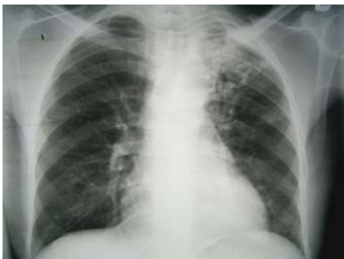
Figure 1a: Chest Xray January 2006