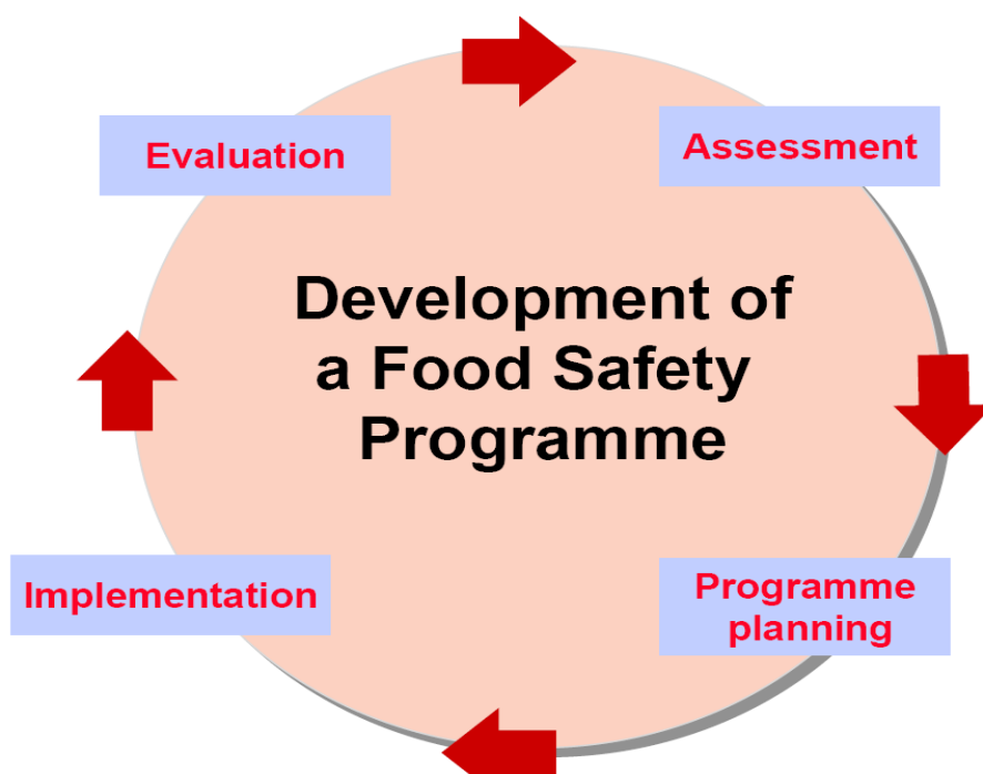
Figure 2: Process for development of a National Food Safety Programme