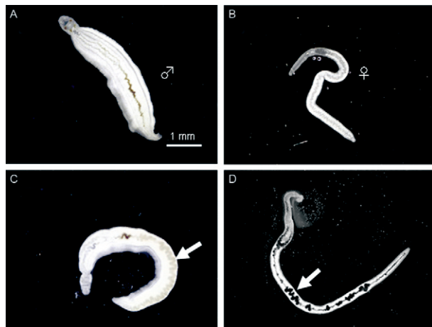
Fig. 2: effect of amodiaquine on morphological alterations of the intestinal tract of male and female adult worms of Schistosoma mansoni . Paired adult male (A) and female (B) worms were incubated in media alone for two days (control group), while another pair of adult male (C) and female (D) worm was incubated with amodiaquine at a concentration of 5 µg/mL for two days. Each living worm was placed between a slide glass with medium and a glass coverslip and immediately observed. Arrows indicate the severe swelling of the intestinal tract of the male (♂) and localization of black content along the intestinal tract of the female (♀) worm.

Some field trials have revealed a strong antischistosomal effect of combination therapies consisting of ART and current antimalarial drugs (Boulanger et al. 2007, Mohamed et al. 2009, Sissoko et al. 2009, Keiser et al. 2010), indicating that ART exhibits antischistosomal activities that are synergistic with current antimalarial drugs. Because ACT with AQ (WHO 2006) is currently recommended as a first-line treatment for malaria, the combination therapy using ART and AQ for the treatment of malaria in schistosomiasis-endemic areas may elicit an additional therapeutic effect on schistosomiasis. Thus, the present findings are noteworthy and can be expected to contribute to the evaluation of the therapeutic effects of the combination therapy on schistosomiasis in field trials. No serious side effects of AQ have been registered to date (D'Alessandro & ter Kuile 2006), but