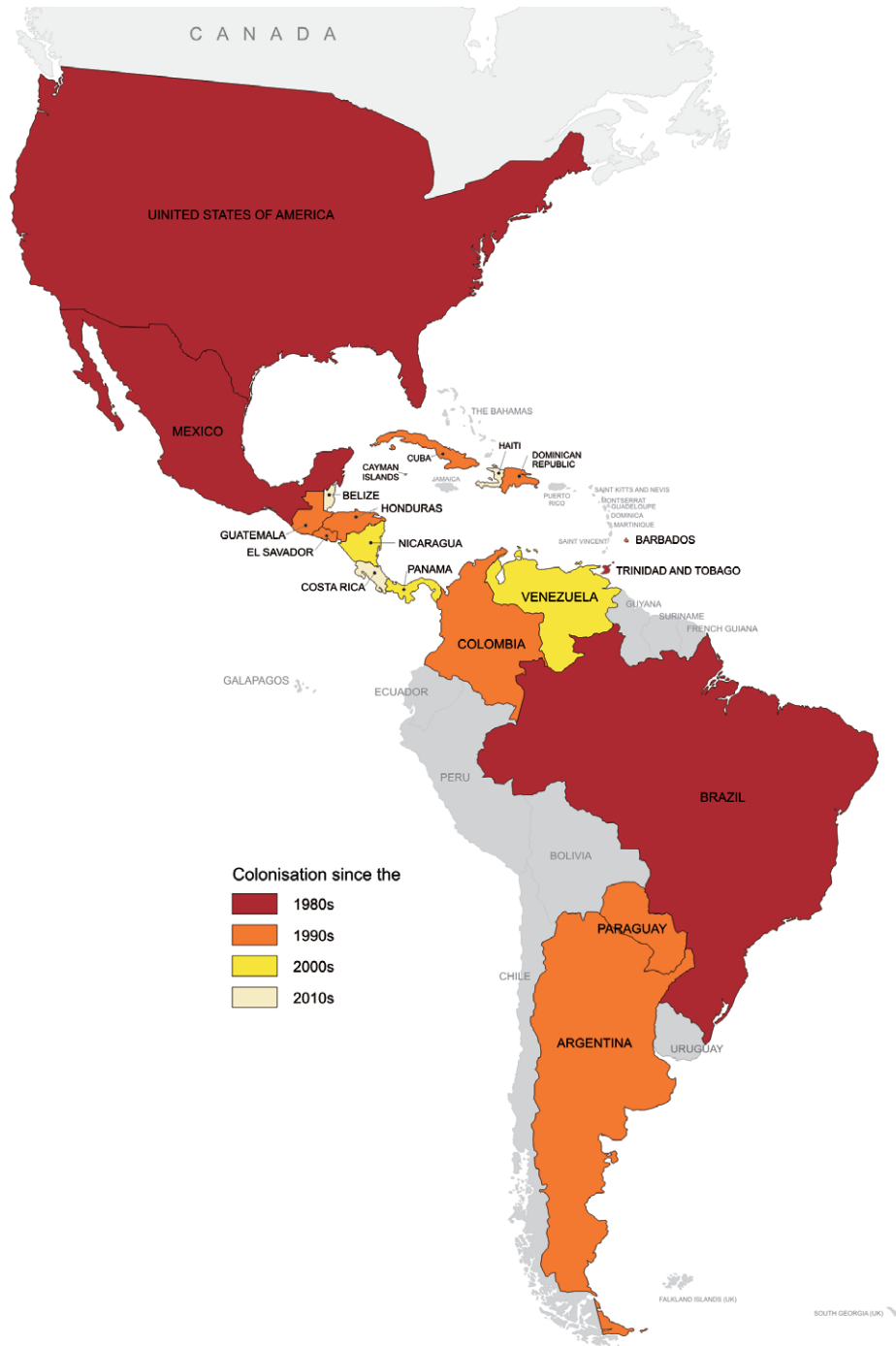
Fig. 3: American countries infested with Aedes albopictus .

dad and northeastern Argentina, in South America, and in all mainland countries in Central America, i.e., Panama, Costa Rica, Honduras, Nicaragua, Guatemala, El Salvador and Belize. In addition, it has also been confirmed in the Dominican Republic, Cuba, Haiti, Barbados, Cayman Islands, and in the USA and Mexico, in North America (Benedict et al. 2007, Navarro et al. 2009, Calderón-Arquedas et al. 2010, Fernández et al. 2012, Wagman et al. 2013, MSES 2014). In Uruguay, a few Ae. albopictus were once detected near the Brazilian border, however subse-