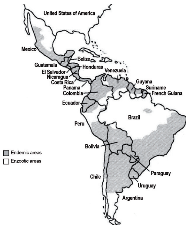
Fig. 2: endemic and enzootic areas of Chagas disease in the Americas. Up to date: Triatoma infestans was eliminated from Uruguay, Chile and Brazil and is under control in Argentina and Paraguay, and Rhodnius prolixus is under control in Central America.

Epidemiological characteristics of Chagas disease in the Americas - Chagas disease in the Americas can be separated into four groups according to the wild, peridomestic and domestic cycles and the situation of human infection and disease (Coura & Dias 2009, Coura et al. 2009).