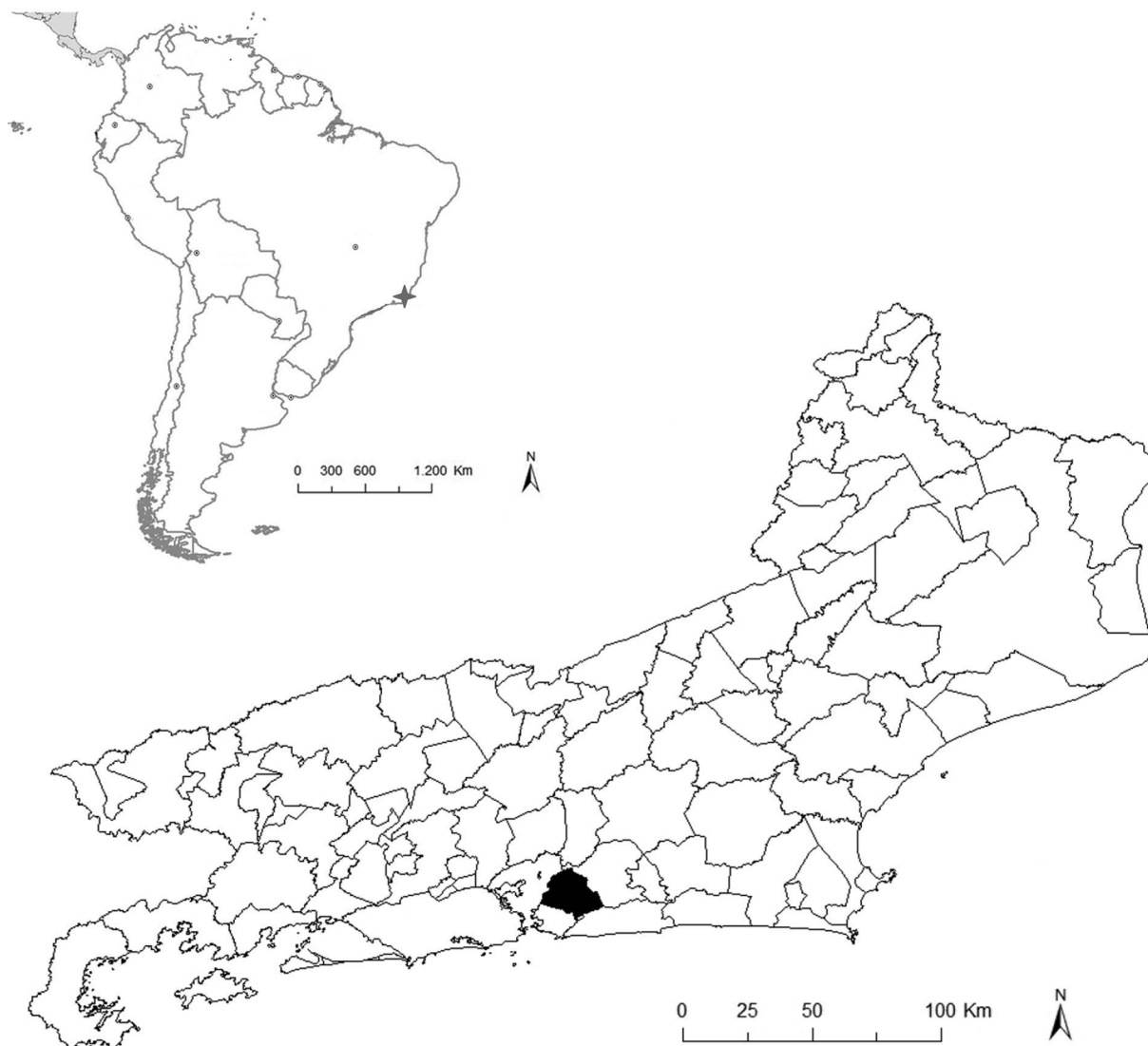
Fig. 1: location of the state of Rio de Janeiro, Brazil, and the municipality of São Gonçalo (black) within the state.

The annual average temperature is 25°C. Maximum average temperature during the study period was 30.9°C in February 2010 and the minimum average temperature was 21°C in June 2010 and July 2011. The annual average rainfall is 120 mm and varied during the study period from 13.9 mm in September 2011 to 341.2 mm in March 2010 (data obtained from São Gonçalo Urban Climatological Station from Geosciences Laboratory, Rio de Janeiro State University).