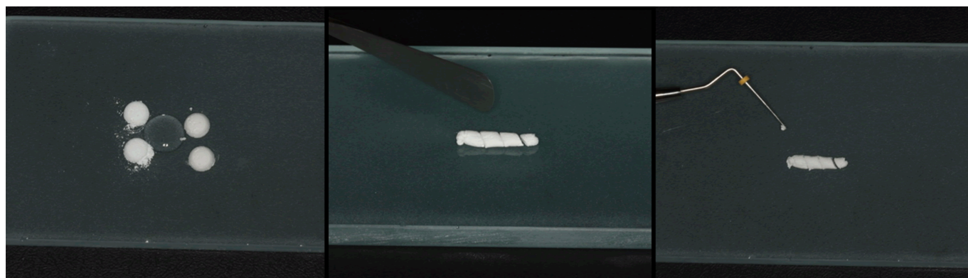
Fig. 3. Mature tooth (Group 2) treated with the root filling paste. (A) Initial radiograph. (B) Treatment with the root filling paste. (C) 12-month follow-up.