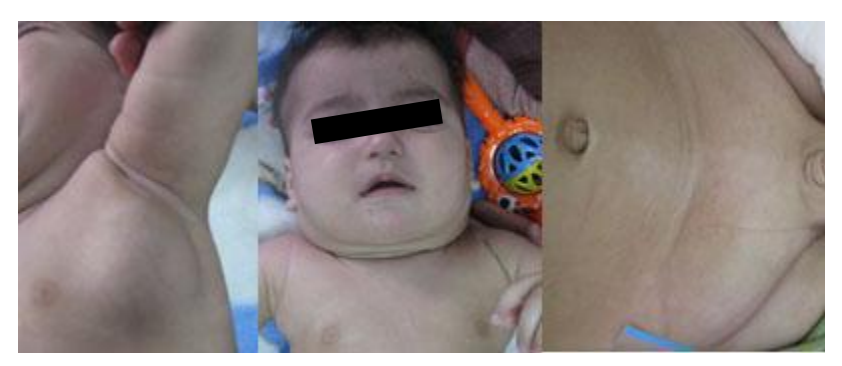
Fig. 1: Cervical, axillary and inguinal lymphadenopathy

admitted to the pediatric infectious disease ward. The patient was a healthy infant till three months ago as his mother noticed a large node on the right side of his neck that had progressive growth and occupied a large portion of cervical area. There was a low grade fever, but no history of upper respiratory tract infection, dyspnea or dysphagia. The child was breastfed and also received supplementary nutrition. Past medical and family history was normal. Clinical examination showed a healthy male infant weighing 8600 gr, length 67 cm and head circumference 45 cm. He had an appearance of bull neck due to bilateral cervical and mandibular LAP. Lymph nodes were discrete, non tender, mobile, matted and about 2 to 6 centimeters in diameter; left axilla and groins also were involved with lymph nodes of almost equal size (Fig 1). Chest x-ray was normal but the skull X-ray showed some lytic lesions in calvarium. The abdominal sonography was normal. White blood cell count 13140/mm³, neutrophils 55.4%, lymphocytes 39.1%, monocytes 4.2%, eosinophils 1.1%, basophils 0.2%, platelets, 530000/mm<sup>3</sup>, ESR 56 in the first hour. Hemoglobin 10.3 g/dl.