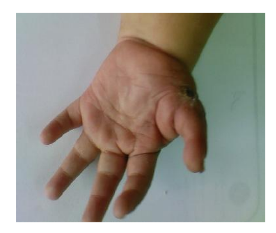
Fig. 3: 8 months later

forcing their son to use his operated hand. After 2 years follow up the hand had acceptable function, prehension (Fig. 3, 4) and there was no sensory deficiency.