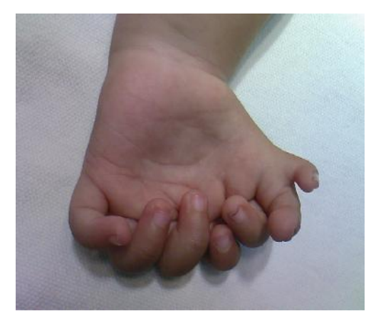
Fig. 1: Gross view of the hand

All fingers were approximately on the same plane and there was no thumb and no syndactyly. Pre and postaxial fingers had similar figures. Thenar prominence was absent. Wrist had flexion deformity and total range of motion of elbow was between 10 and 80 degrees. The shoulder range of motion was acceptable and scapula was not hypoplastic. Radiogram showed