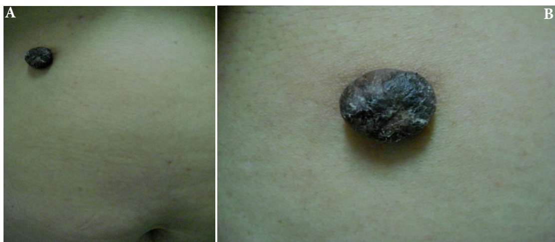
Figure 1: A and B. Hyperpigmented, hyperkeratotic nodule on abdominal skin. lesion Appear to be 0.5 mm long x 0.3mm wide in size

barricade, with pigmented areas and few dilated ducts, which are in contact with the resection margins, compatible with eccrine poroma (Fig. 2). Immunohistochemistry was also performed, highlighting Carcinoembryonic Antigen (CEA) with elongated cells that line the cavities that support glandular differentiation. S100 staining was observed in the dendritic cells and melanocytes in the thickness of the cell proliferation (Fig. 2).