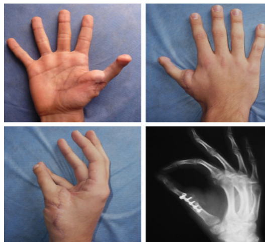
Figure 2. Good result is seen at 8 months at follow-up with the second toe-to-hand transplantation. The patient is happy with the result.