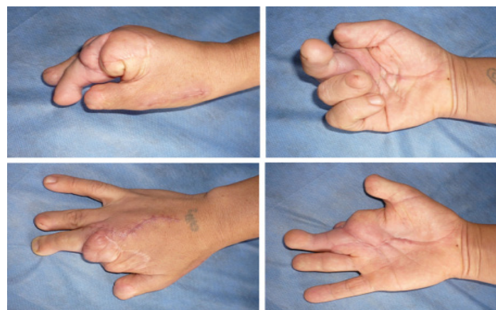
Figure 4. Postoperative result is observed at 4 months after transplantation. She is very satisfied with their function and aesthetic appearance

second toe transfer may be the most appropriate option because it allows a bigger exposure of the metatarsal region without increasing the morbidity of the donor site. Any of these techniques have a success rate between 95-100 % 2,3,9,10 .