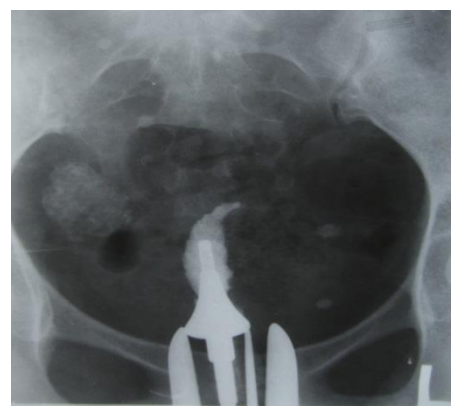
Figure 9. Complete obstruction of uterine cavity with glove's finger appearance. Pelvic calcification (probably lymph node calcification) is detected.