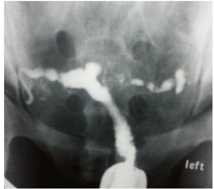
Figure 2. Case 2: Irregular uterine cavity and clover leaf appearance. Irregular border and beaded appearance in both fallopian tubes