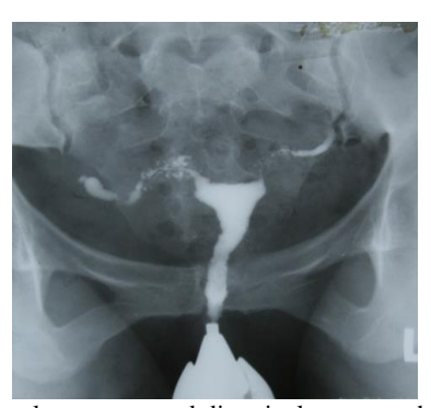
Figure 7. Normal shape of uterine cavity, irregular contour and diverticular outpouching which surround isthmus of right fallopian tube and make SIN appearance.