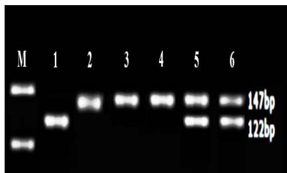
Figure 2. The enzyme digestion pattern of rs2910164. M is 50-bp size marker; Lane 1 is wild-type homozygous alleles (C/C); Lane 2, 3 and 4 are mutant type homozygous alleles (G/G); Lane 5 and 6 are heterozygous alleles (C/G).