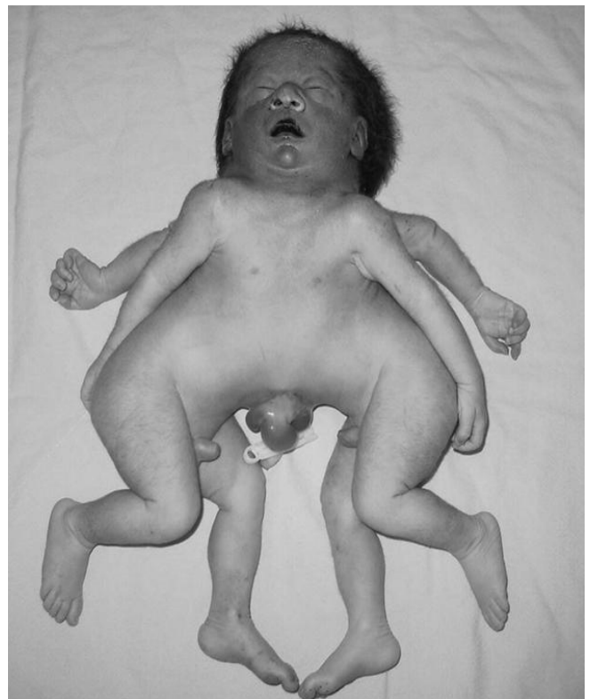
Figure 4: Postmortem photograph of cephalothoracoomphalopagus conjoined twins- anterior aspect [3].

In humans, delayed ovum transport through the fallopian tube increases the risk of twinning; progestational agents and combination contraceptives may be the origin of this delay due to decreased tubal motility [1]. This lady conceived in close temporal proximity of contraceptive use, which may have increased the risk of twin pregnancy of course not the risk congenital abnormality happened and this should not be a pretext to fear or reject the use of contraceptives. On the classification point of view, these twins were conjoined laterally and may be classified as parapagus united twins (Fig. 4, 5) [3, 8], and the fused parts could not allow extra uterine survival. Pregnancy termination, if informed consent obtained, would have been a better option if ultrasound prenatal diagnosis was made.