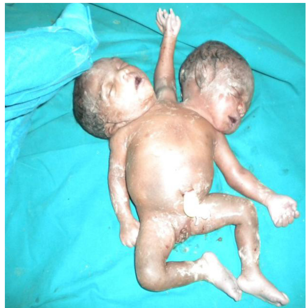
Figure 1: Photograph of parapagus conjoined twins born on August 19th, 2010 in Kabutare district hospital.

During the night of August 18-19th, 2010, a 28-year old woman, gravida 4, para 3, alive 3 was referred to Kabutare district hospital from a local health center for breech presentation after a delivery labor had started. In her personal history, she did not remember the date for her last menstrual periods, used to take contraceptives (pills or injections) between a pregnancy and the following and she had not been aware of the current pregnancy until she started feeling fetal movements because she conceived after missing an appointment for injection of a contraceptive. No special remarks were detected during prenatal visits at health center and there was no ultrasound performed before. On arrival an emergent cesarean delivery was performed and we extracted a two headed female baby with 2 separate upper limbs, a third common upper limb bearing 8 fingers on fused hands, on mirror image feature according to Bateson's rule, which states that when duplicated structures are joined during critical developmental stages, one structure is the mirror image of the other, between the 2 heads and 2 lower limbs on a single trunk (Fig. 1).