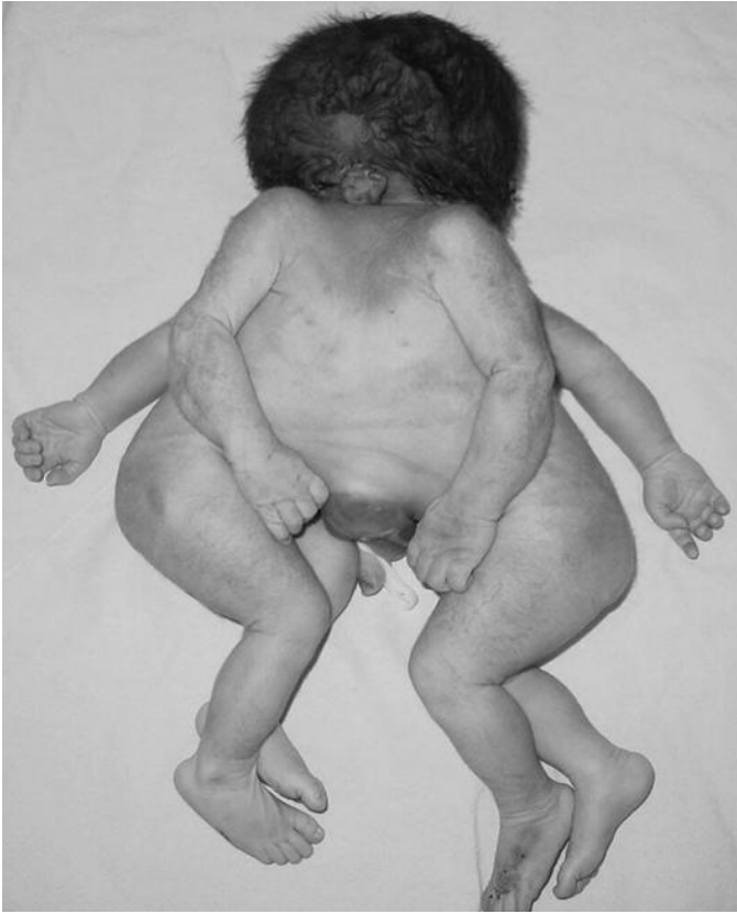
Figure 5: Postmortem photograph of cephalothoracoomphalopagus conjoined twins- posterior aspect [3].

is unknown although the mechanism may be understood by good examination of the conjoined. Surgical separation might be possible if conjoined twins do not share vital organs and depending on the complexity of the fusion area. Prenatal diagnosis is essential and therapeutic pregnancy termination may be a parental option, especially for cases with a poor prognosis after genetic counseling.