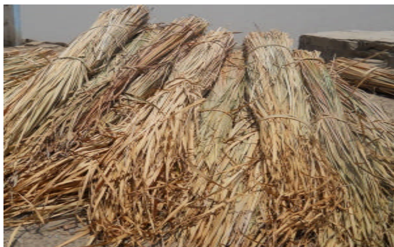
Plate 1: Bundles of Typha plants collected for making mats and baskets

On the basis of above mentioned data, it looks as if Punjab was vastly diversified in having wild aquatic medicinal plants that are being used in Gastrontology (66%), Neurology and Cardiovascular diseases (28%), Respiratory diseases (39%) and Dermatology (17%) in Fig 01. In Punjab, most of the inhabitants have a rural background with an extensive experience in folk medicines as local herbalists and healers. It can be eagerly sought out after the present research work that wetlands of Punjab comprise a significant medicinal flora. The present ethnobotanical survey of aquatic plants of Punjab demands that the ethnopharmacological activities of these plants should be evaluated to support the efforts for the improvement of pharmaceutical industry in terms of natural drug resources for the synthesis of new drugs, that can be very effective against resistant pathogens. This can also lead to the protection of these plants especially from threatening and endangering factors. Most of the young people do not know about such ethnomedicinal uses of the aquatic and semi aquatic plants.