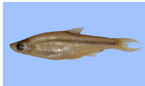
Figure 5 Toxabramis nhatleensis , paratype, HNUE, 61.6 mm SL, reversed, lateral view

Key diagnostic features of T. nhatleensis are lls 39–41; gill rakers on the first branchial arch 27–35; and posterior edge of dorsal spine with 11–13 serrations. I have examined a 61.6 mm SL paratype, which is depicted herein (Figure 5). Although it is objectively a valid species within Toxabramis , the ventral keel in T. nhatleensis does not reach pectoral fin origin.