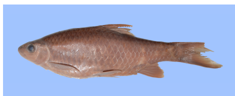
Figure 2 Poropuntius aluoiensis , holotype, HNUE VI.1.I.21, 193.8 mm SL, lateral view

paratypes (133–140 mm SL [the SL of the largest paratype is given as 40 mm, which I consider to be an inadvertent typing error, and thus corrected it to 140 mm]). The type series is stored in HNUE. The jar containing the holotype bore the number VI.1.I.21. The specimen displayed in the original description (Nguyen, 1997; freshly dead specimen) is assumingly the holotype. It is clearly the specimen that I have examined and is depicted herein (Figure 2). It shows the damaged upper caudal fin lobe and the curved abdomen in the prepelvic portion as the specimen I have examined. I have measured its SL to 193.8 mm.