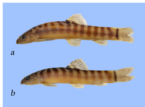
Figure 14 Schistura tamduongensis , lateral view; a. Paratype, LC.09.03.005, 60 mm SL, reversed; b. Paratype, LC.09.03.003, 50.9 mm SL