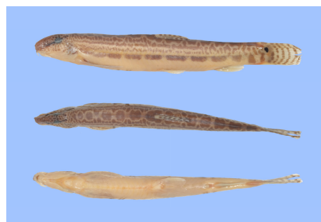
Figure 1 Cobitis ylengensis ; RIA1, 82.7 mm SL, lateral, dorsal and ventral view

Province. This central province is chiefly drained by the coastal Gianh River. The type series has the Lot number 501 of RIA 1. It was contained in a jar and carried a clean, printed label. There were eight untagged specimens in the jar, while the original description gives four type specimens (Ngo, 2003). After evaluating the batch, one 82.7 mm SL specimen was examined, measured and photographed. Since the figure accompanied with the original description is less informative, the examined specimen is figured here (Figure 1). It could not be clarified if this specimen belongs to the type series. Kottelat (2012) treats C. ylengensis as a valid species, which is corroborated herein.