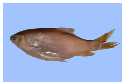
Figure 3 Spinibarbus maensis , holotype, HNUE, 261 mm SL, lateral view

The original description (Nguyen et al in Duong et