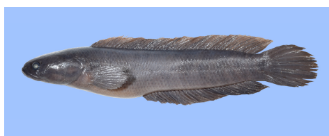
Figure 16 Channa hoaluensis , paratype, NB. 10.05.002, 214 mm SL, lateral view

In the absence of a code-conform original description, the name C. hanamensis is treated as a nomen nudum with provisions as specified herein.