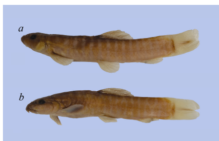
Figure 13 Schistura pumatensis , lateral view; a. Holotype, PM020170, 64.2 mm SL, reversed; b. Paratype, PM020172, 57.7 mm SL

Schistura phongthoensis Nguyen, 2005 is treated as a valid species. Due to the loss of the type material, the collection of topotypes and a subsequent designation of a neotype are required. Interestingly, a recently published monographic paper about Vietnamese Schistura species neither list nor mentioned this taxon (Nguyen & Nguyen, 2008).