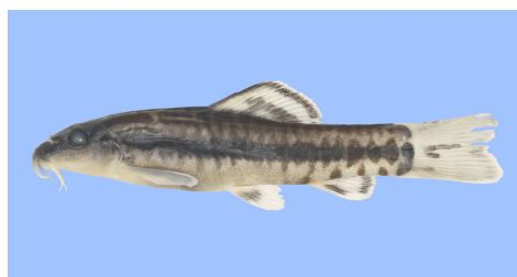
Figure 10 Traccaticthys pulcher , KIZ2012000177, 53.9 mm SL, lateral view