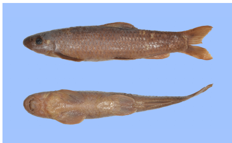
Figure 6 Vinagarra laichowensis , paralectotype, RIA 1, LC.65.01.002, 73.3 mm SL, lateral and ventral view