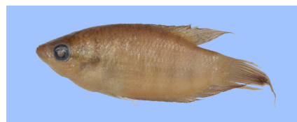
Figure 18 Macropodus oligolepis , holotype, 37.6 mm SL, lateral view

Macropodus oligolepis Nguyen, Ngo & Nguyen, 2005 (Figure 18)