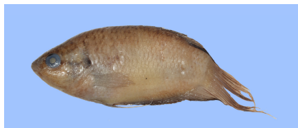
Figure 17 Macropodus lineatus , holotype, 47.8 mm SL, reversed, lateral view

Macropodus lineatus Nguyen, Ngo & Nguyen, 2005 (Figure 17)