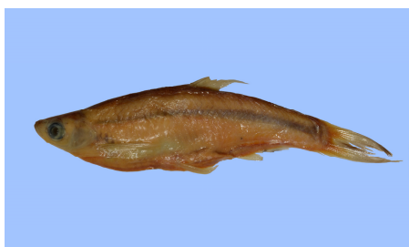
Figure 4 Toxabramis maensis , paratype, HNUE, 74.8 mm SL, reversed, lateral view

Oshima, 1919 (Kottelat, 2001a). S. maensis is herein considered a valid species of Spinibarbus Oshima, 1919. Synapomorphies of Spinibarbus are well explained in Yang & Chen (1994). The taxonomy of Spinibarbus is chaotic, particularly that of the Vietnamese taxa. The entity of original descriptions of Spinibarbus spp. of Vietnamese authors was compiled in Vietnamese language. English summaries of these descriptions are of low informative value in many instances, which makes it nearly impossible for foreign researchers to work with.