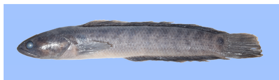
Figure 15 Channa hanamensis ; holotype, H.Na.10.02.001, 226 mm SL, reversed, lateral view