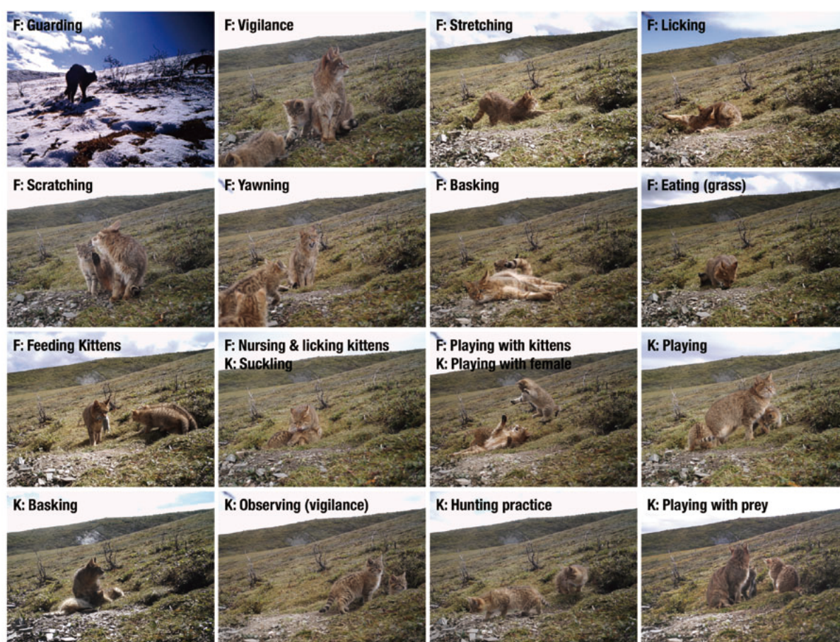
Figure 2 Behaviors of adult female and kittens of Felis bieti (F: Female. K: Kitten)

Habitat preference of the Chinese mountain cat has not been studied in depth, although several descriptions have been made based on previous field observations (Chen et al., 2005; Liao, 1988; Yin, 2007). For breeding dens, Sanderson et al. (2010) concluded that these cats prefer “abandoned dens excavated by marmots or badgers” on south-facing slopes of “grasslands or bush-covered mountains”, which was confirmed by our observations. Chen et al. (2005) and Yin (2007) stated that the Chinese mountain cat prefers to inhabit alpine meadows. This could be explained in Supplementary