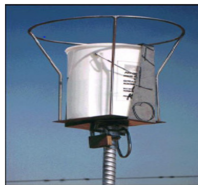
Fig. 3: Single open bucket sampler (ASTM D1739, 2010)

The method did not have a wind shield around the bucket so that both coarse and fine precipitating dust samples could be collected irrespective of the wind situation. Settling dust material was collected in 20 L cylindrical plastic buckets half filled with distilled water (10 L). The height (h), radius (r) and the area (A) of the bucket (bottom) are 0.342 m, 0.138 m and 0.060 \text{m}^2 respectively (Figure 3). Exposed buckets were replaced after 30 days of sampling period and transported to the laboratory for further treatment and analysis. Water – dust sample mixtures were separately filtered through pre-weighed 0.47 mm Whatman filter papers under low pressure. The samples were air dried in partially open petri dishes in a “dust free laboratory”. After drying, gravimetric analysis was conducted to determine the insoluble fraction which is based on dust deposition rate equation: